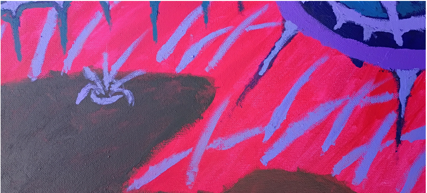
UNDER A WARPED SKY: A WORK IN PROGRESS

Δ STRANGE RED FILLS THE AIR ABOVE, THE STARS WEEP AND FLEE, THE WORLD ITSELF BEGINS TO TILT UNDER THE TYRANNY OF THIS... THIS NOT-STAR. Δ SINGLE OBSERVER BEARS WITNESS, RAPT, THOUGH IN TERROR OR IN AWE, WHO CAN SAY, WHILE SHE OBSERVES THE WORLD AS SHE KNOWS IT COMES TO AN END.